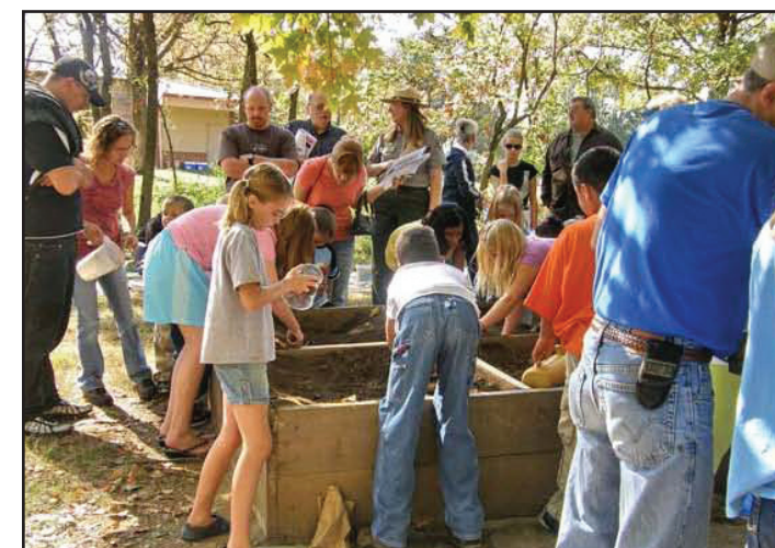
Junior Archeologist Programs