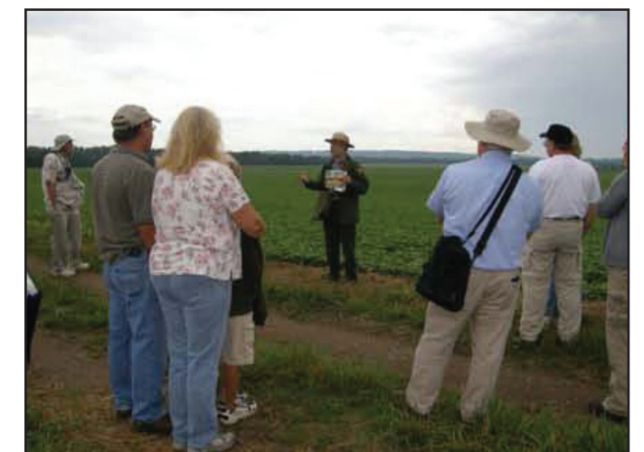
Seasonal Guided Hikes