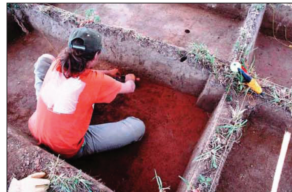
OSU Field Research Site

The following is a graphic tour of the proposed improvements to the site using plans, sketches and images that demonstrate the design intent. The tour begins at the visitor orientation space and proceeds through the park. Descriptions of specific activities, exhibits and program items are provided. A plan view with descriptive legend is included to give an overview of the entire development area.